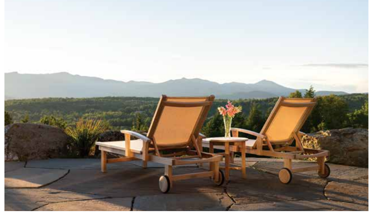
ABOVE: The west-facing patio means unobstructed sunsets from a private perch that's only 400 feet away from the main residence via a stone-paved bridal walk, originally created by Cushman Design Group for a family wedding. RIGHT: The sunken firepit is a family gathering place even when Peak Sanctuary isn't in use. FACING PAGE: A wrought-iron bed frame by Made Goods helps keep the second-floor guest room feeling light and airy like the rest of the retreat.

A sturdy portico of Douglas fir helps break up the boxy outline of the twostory home, and a variety of durable native woods stand up to harsh Green Mountain winters. "It's a serene and natural space but also luxurious in its lighting and amenities," notes Flanagan.